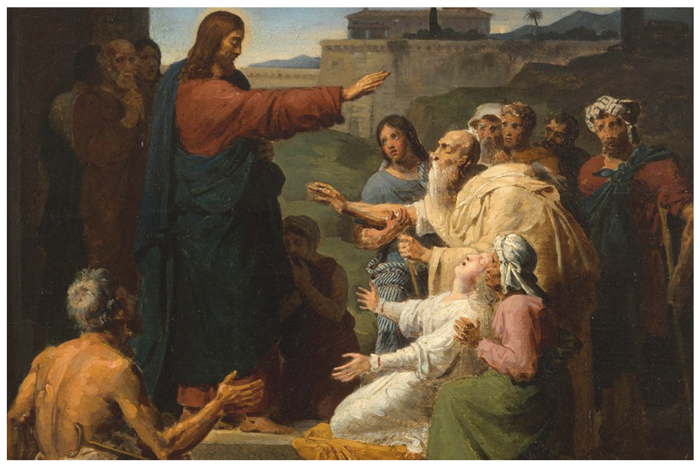
"The man called Jesus made mud, spread it on my eyes, and said to me, 'Go to Siloam and wash.' Then I went and washed and received my sight."