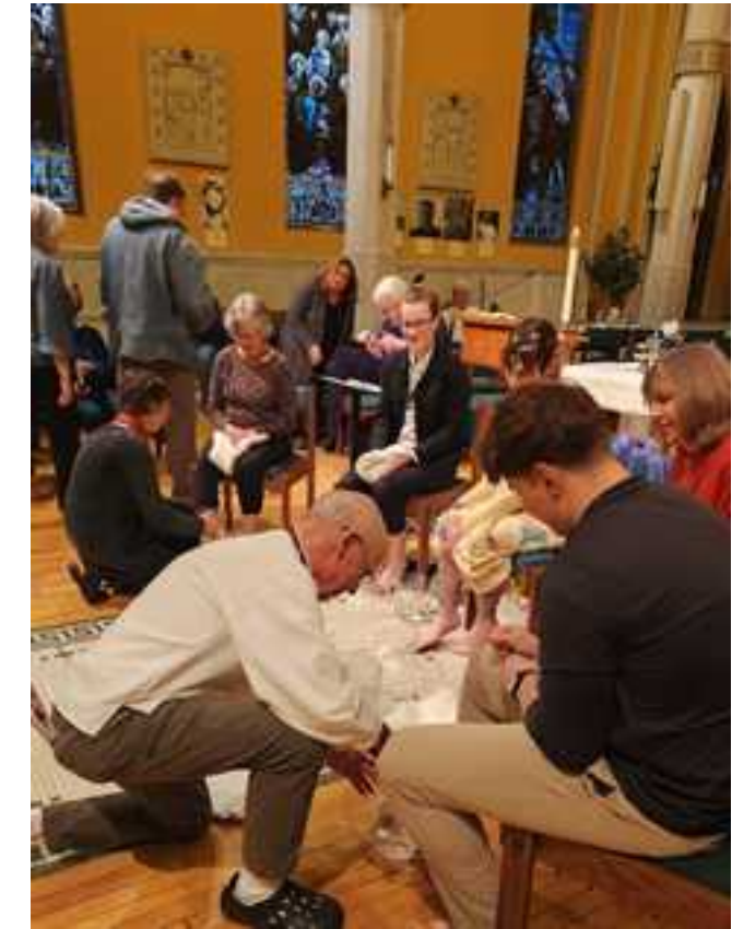
Re-enactment of Jesus washing the feet of His disciples