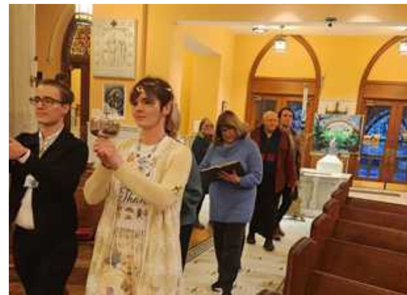
The procession of the Holy Eucharist.