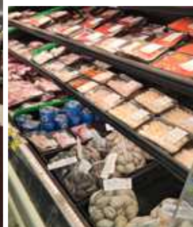
Fresh seafood too!